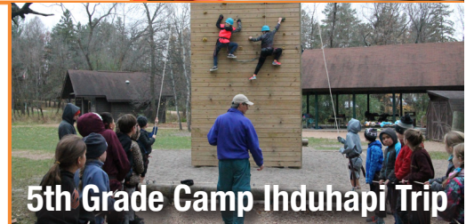
5th Grade Camp Iduhapi Trip

Kids Place location for before and after school child care