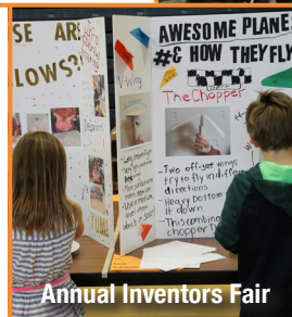
Annual Inventors Fair

Author Day Carnival Musical Performances Read-a-Thon Walk and Bike to School Week