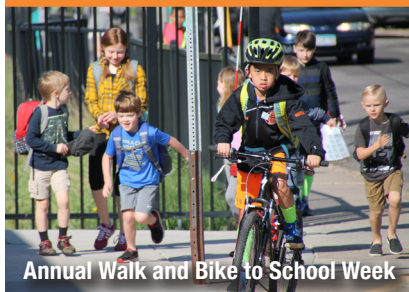
Annual Walk and Bike to School Week