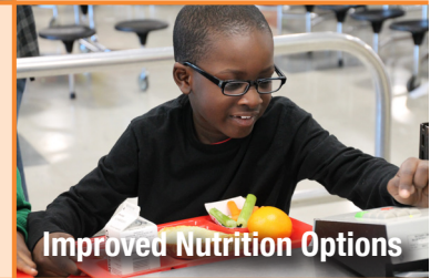
Improved Nutrition Options