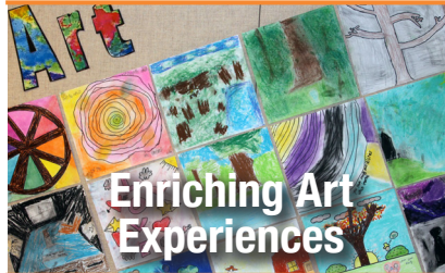
Enriching Art Experiences